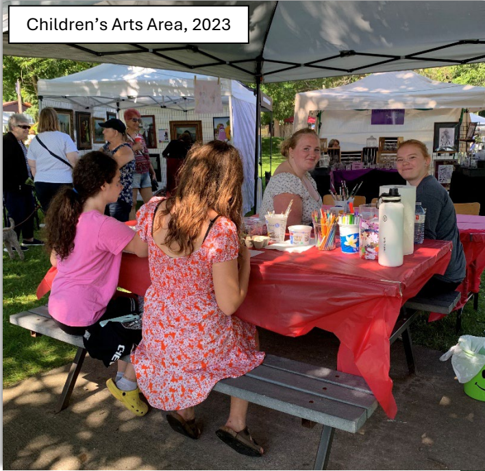
Children's Arts Area, 2023

Art in the Park continues this year on Saturday August 2, 2025 – learn more here at Art in the Park 2025 . Look for a park full of tents and lots of people from near and far enjoying all the treasures to be bought, live music, a children's art area, visiting friends old and new, and a lovely lunch!