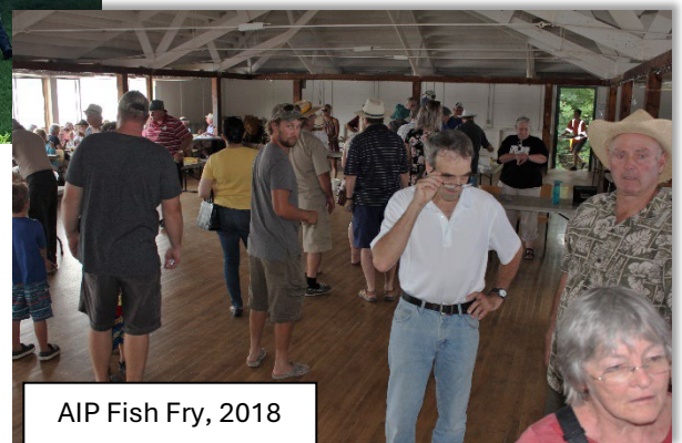
AIP Fish Fry, 2018