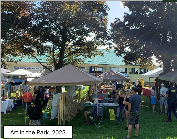
Art in the Park, 2023