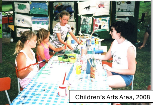
Children's Arts Area, 2008

Art in the Park continues this year on Saturday August 2, 2025 – learn more here at Art in the Park 2025 . Look for a park full of tents and lots of people from near and far enjoying all the treasures to be bought, live music, a children's art area, visiting friends old and new, and a lovely lunch!