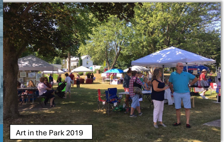
Art in the Park 2019

By 1991, the show had been moved to Memorial Park in Tweed, where it has continued ever since. Over the years, it was harder to draw a crowd for Fine Arts, so it was opened up as an Arts and Craft show. All items must be made by the vendor. From a year of only 12 vendors, this show has grown to 45+ artists and artisans. It also