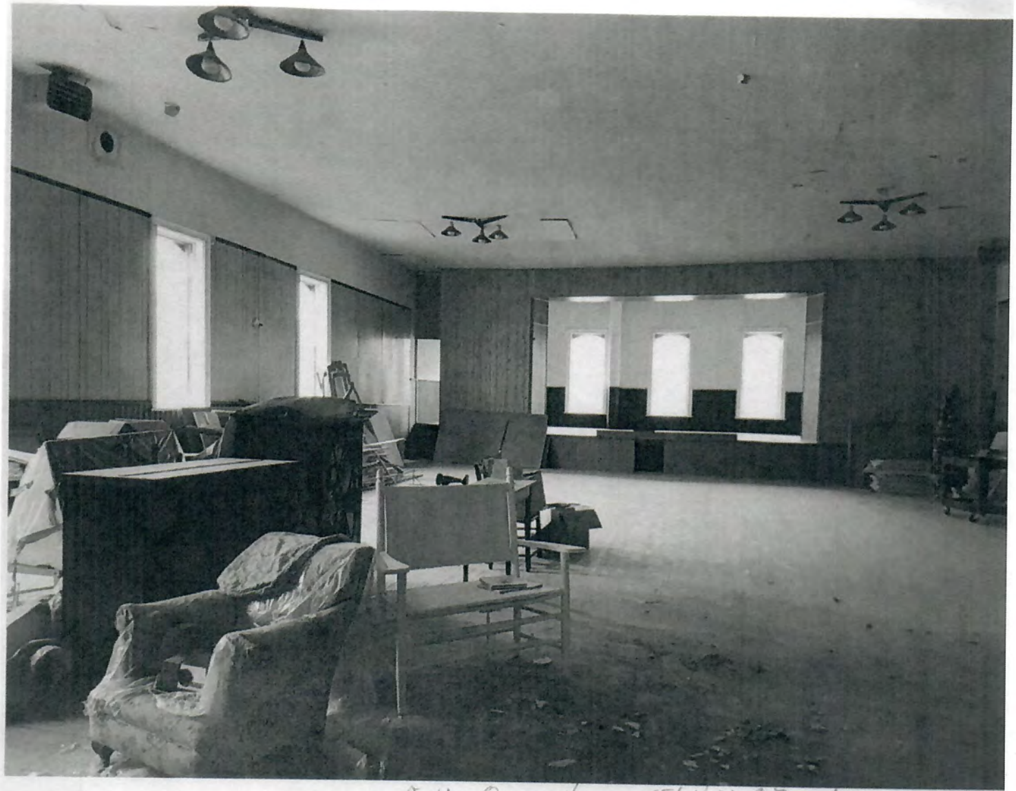
Detlor Opera House 256 V. St. N. - 2 nd floor 2017