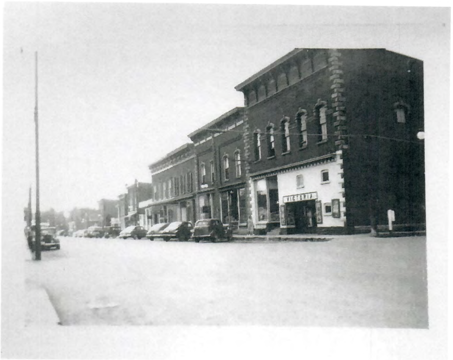
Victoria Theatre (1937 - ca 1963)