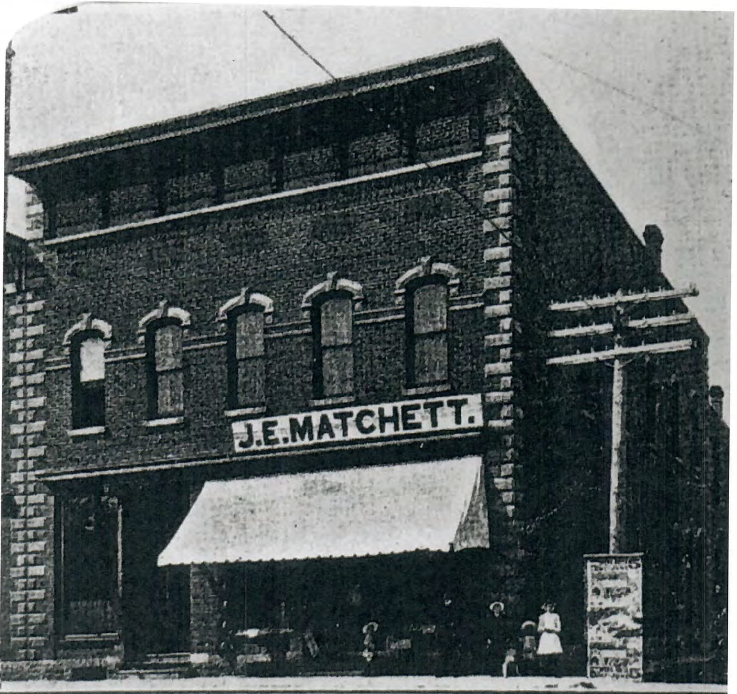
JAMES MURPHY BLOCK, CONTAINING GENERAL STORE, POST OFFICE AND OPERA HOUSE