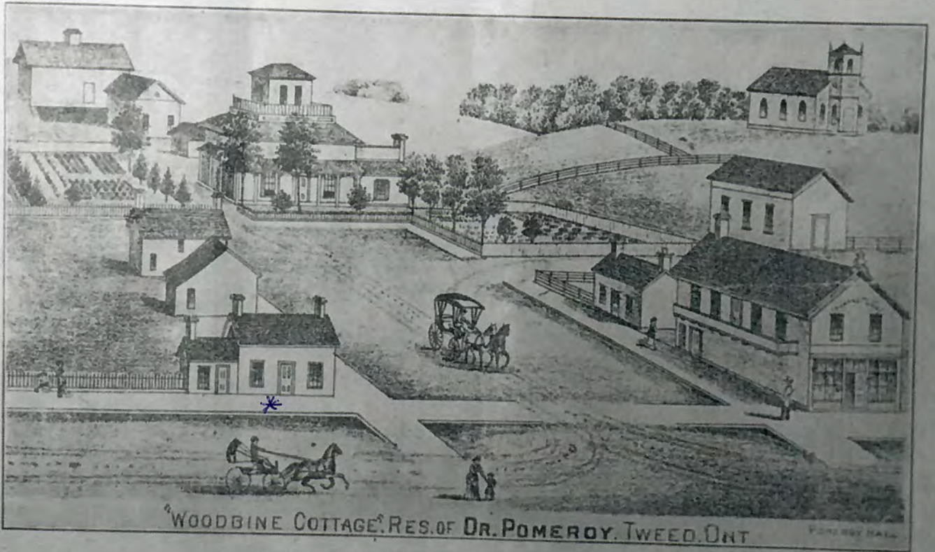
PENCIL SKETCH OF TWEED BEFORE THE ADVENT OF RAILWAYS